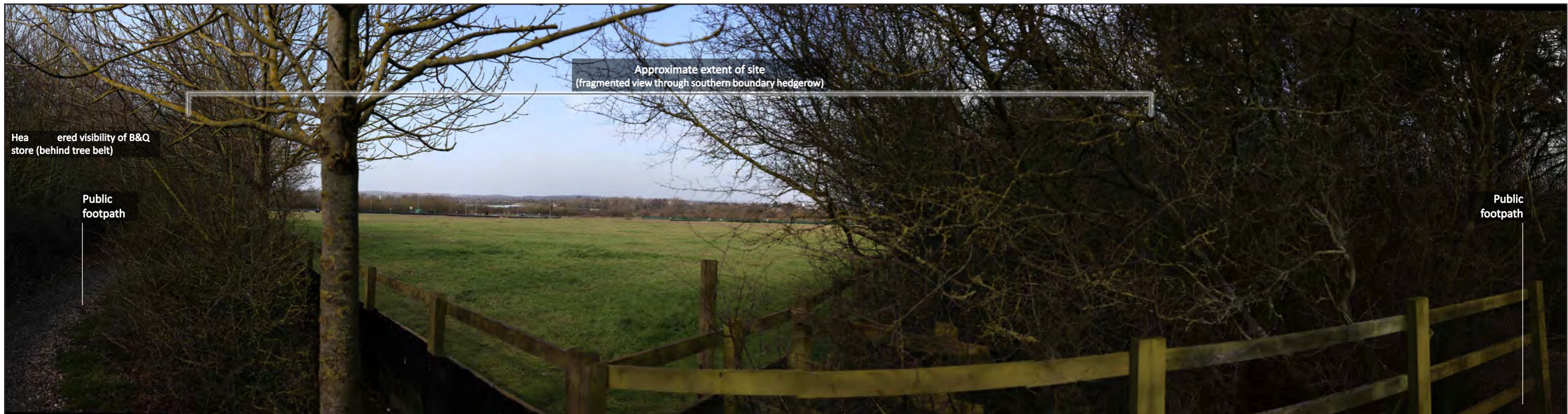
Viewpoint 1 - View northwest from the public footpath on the south eastern boundary of the site